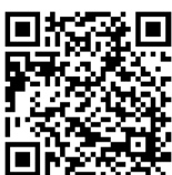
Product information Arctigo IS

Arctigo IS is a wide and flexible range of single discharge industrial air coolers for both cooling and freezing applications in medium to large cold rooms. Detailed product information is available on-line on www.alfalaval.com . For spare parts prices we refer to the Alfa Laval Anytime ebusiness platform or the Spare Parts Price List.